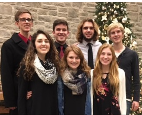
Solid Rock youth who participated in the 11:00 Christmas Eve service

Please leave your items in the wooden boxes in the narthex.